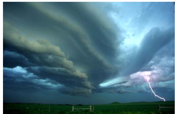
South Dakota Storm First Place, Landscape Color Slide Category CCCC Salon, April, 2002

As we continue to increase our emphasis on prints , including digitally manipulated and generated prints, our new year beginning in September will have an increased number of print competitions. There will be three print competitions and six slide competitions, in addition to our print and slide competitions in the annual April Salon. As we decided last year, and in line with the policies of PSA and CICCA, digitally manipulated prints will be entered and judged in the same categories as prints made in the “traditional darkroom” manner. The six slide competitions will include 15 categories. Two of these will be on flora, with separate categories for flowers and for trees and other flora. In the Salon, the category flora will remain as it has been over past years.