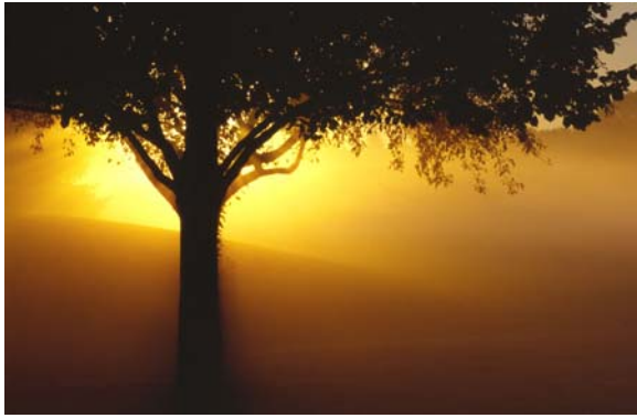
Mystical Glow, by Barry Brehm First Place, General Color Slide Category CCCC Salon, April, 2002