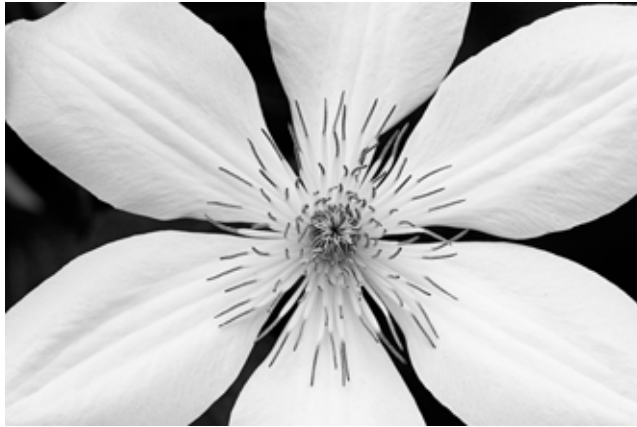
Clematis First in 2005 Salon Large B&W Print Category Print of the Salon

September 21, 7:30 PM. At the present time, we expect to have a program that deals with photographic techniques, possibly digital techniques.