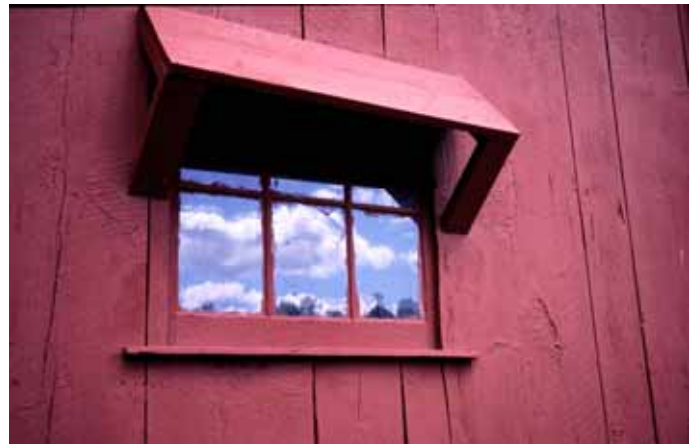
Barn Window First in 2005 I-74 Challenge, Slide Division

The I-74 Challenge, topic Reflections, was held in Urbana on Friday evening, May 13, at the Carle Campus Forum. The competition consisted of two parts: Slides, for which ribbons were awarded, and Prints, a trial division, in which prints were judged but ribbons were not awarded.