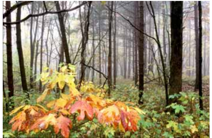
Foliage and Fog First in 2005 Salon Slide Flora Category Slide of the Salon

couple of days. Make sure you mention that you are a member of our camera club.