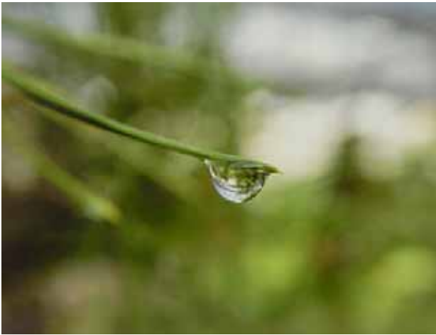
World in a Droplet 2006 Best In Show Fourth Place First in Nature Category