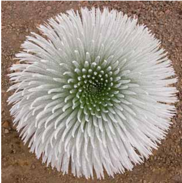
Silversword 2nd Place in Nature, Digital Division 2006 CCCC Annual Salon

Wednesday, November 15, 7:30 PM. Digital Competition. Categories are A. Manipulation. B. Windows and/or Doors. C. Flora.