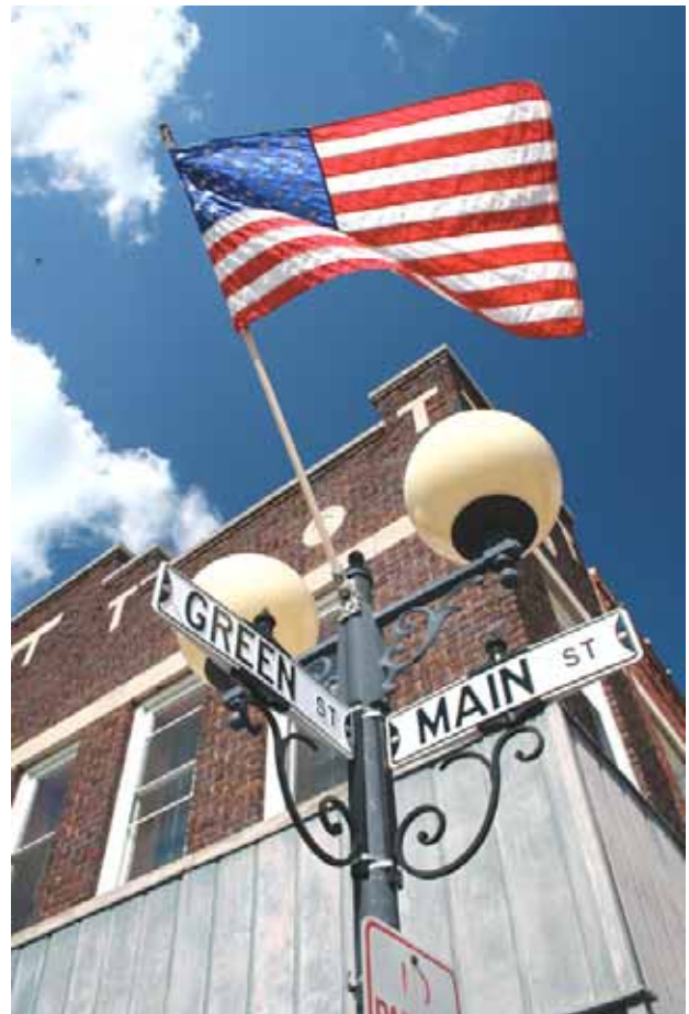
Downtown Farmer City

Wednesday, April 11, 7:30 PM. Farmer City and Vicinity. Members have been asked to make images within five miles of the I-74 Exit 159 (Farmer City) throughout the year. The exact number of images each maker can show will be approximately one dozen, depending on how many images each person has made. A final number will be determined at the March 21 meeting. These images should be taken after May 10, 2006.