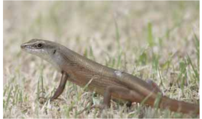
Guam Salamander © 2006 Kathi Waltermire

Wednesday, January 10, 7:30 PM. Short Image Shows by Members. When we have done this in the past, the short shows have generally been successful. A show should be limited to 80 images. It can be either a slide show or a digital show. We can do three, possibly four, such shows at the meeting.