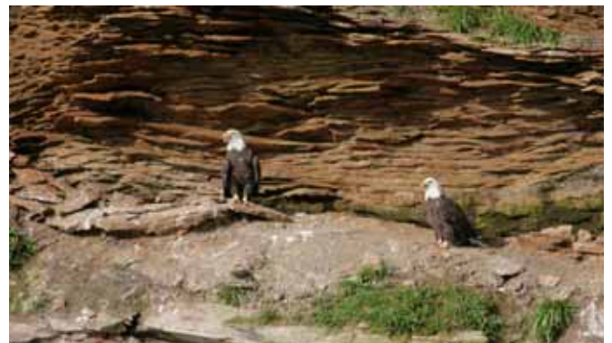
Bald Eagles Eagles are on one of the Bird Islands in the Atlantic Ocean off Nova Scotia

is a county park located near Fountain, IN, about half way between Covington and Attica. It is sort of a small size Turkey Run as far as trails and cliffs are concerned. It is not too far from the Wabash River. As part of the trip, we may wish to visit Williamsport and Attica, A very nice waterfall is located in Williamsport. The images taken on this outing will be used as the basis of the February 7 program. We will discuss at one of the meetings directions to Portland Arch, where we will meet in Indiana, and so forth.